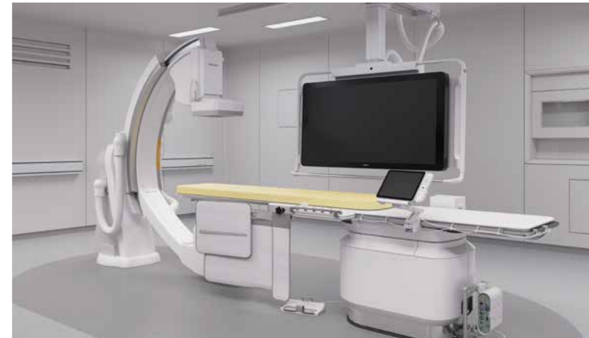
Azurion 3 M12 Monoplane Floor Mounted