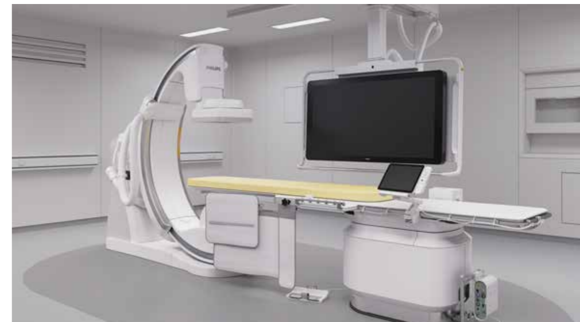
Azurion 3 M15 Monoplane Floor Mounted

The bigger field size on the FD12" (30 cm) is perfect for navigating towards the coronaries and for left ventricle imaging. You can also see bigger parts of the aorta with this detector size. 10"